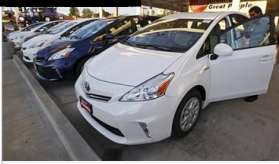
An employee parks a Toyota gas-electric hybrid automobile in a row of similar cars at a dealership in Los Angeles Thursday, Jan. 26.

likely to end up with a lemon. In the past five years, global competition has forced automakers to improve the quality and reliability of their vehicles — everything from inexpensive mini-cars to decked-out luxury SUVs. The newfound emphasis on quality means fewer problems for owners. It also means more options for buyers, who can buy a car from Detroit or South Korea and know it will hold up like a vehicle from Japan. With few exceptions, cars are so close on reliability that it's getting harder for companies to charge a premium. So automakers are trying to set themselves apart with sleek, cutting-edge exterior designs and more features such as luxurious interiors, multiple air bags, dashboard computers and touch-screen controls.